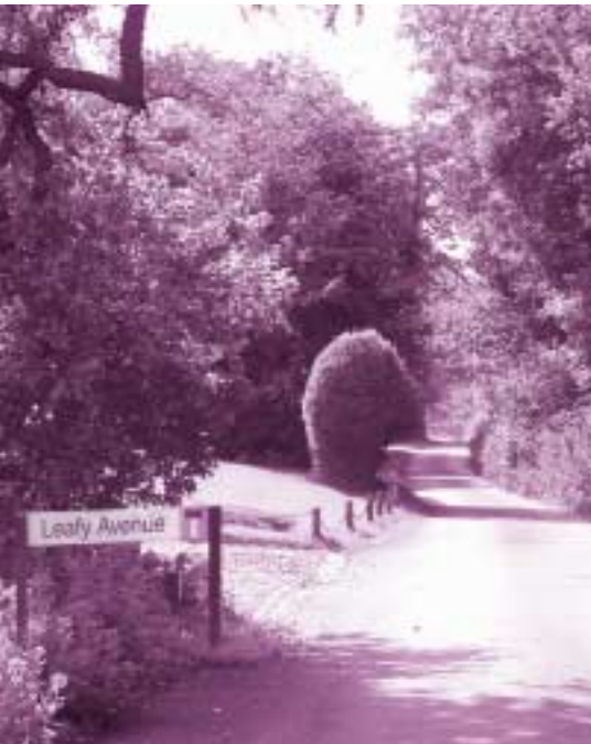
> Find any location

Smartnav combines the very best in navigation technology with the personal touch. Simply press the Smartnav button and you will be connected to one of a team of PAs, trained to locate your destination and assist with a wide range of motoring needs, 24 hours a day, 7 days a week. Unlike conventional systems, which require a complicated destination entry process, the Smartnav system couldn't be simpler. It doesn't even matter if you don't have the exact details of your destination. Using part of an address, or just the postcode, the Smartnav PA has access to a comprehensive, up-to-date database, which gives them the complete address.