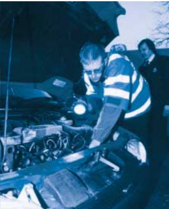
> Broken down...

In unfamiliar surroundings, a Smartnav PA can provide help and reassurance 24 hours a day, 7 days a week.