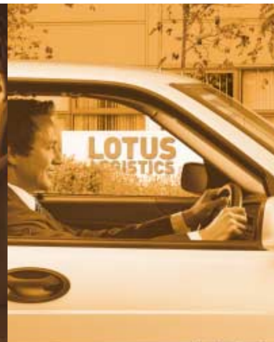
➤ Press the Smartnav button and... ➤ tell the PA your destination...