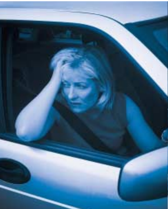
> Alone and stranded...

In the event of a breakdown or emergency, it can be frightening to find yourself stranded, particularly if it's late at night and you're on your own. As soon as you press the Smartnav button, a PA can automatically pinpoint your exact location and call for assistance. Your location details will be sent directly to the appropriate breakdown or emergency service, so you can feel reassured that help is on its way.