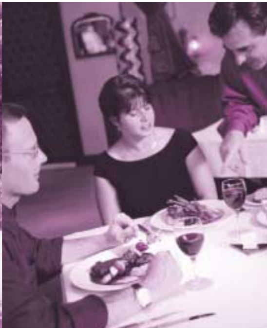
> Work, rest and play!

In addition to UK residential and business address listings, thousands of other useful or remote destinations, including petrol stations, shops and hotels, are at the PA's fingertips.