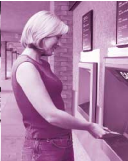
> Finding the nearest bank...

With in excess of 90,000 places of interest available, visiting that restaurant in the middle of nowhere your friend recommended couldn't be easier, or stopping off for a bite to eat in unfamiliar surroundings becomes simple and stress-free.