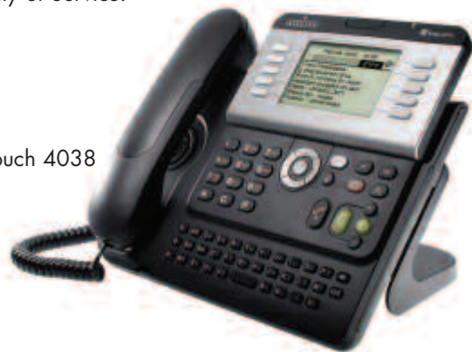
Alcatel IP Touch 4038