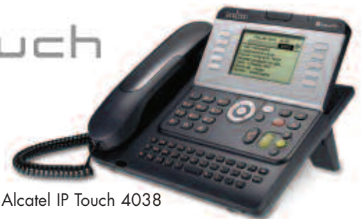
Alcatel IP Touch 4038